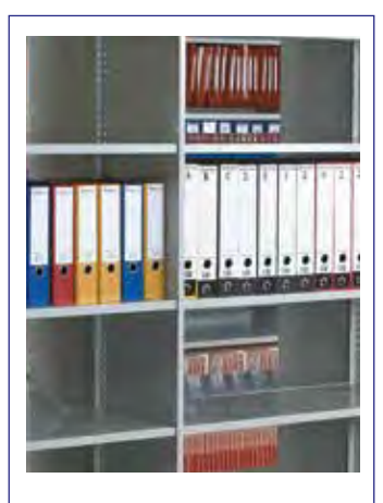
Slim 20mm profile uprights combine with 25mm section shelves to be aesthetically pleasing and maximise available storage space.