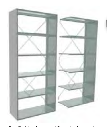
Duo Shelving Starter and Extension bays make ordering easy. To create a run just order a Starter Bay and the correct number of Extensions Bays.